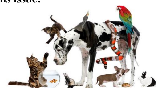
Blessing of the Pets Saturday, October 2nd