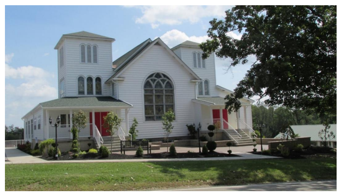
Sundays School – 10:00 am