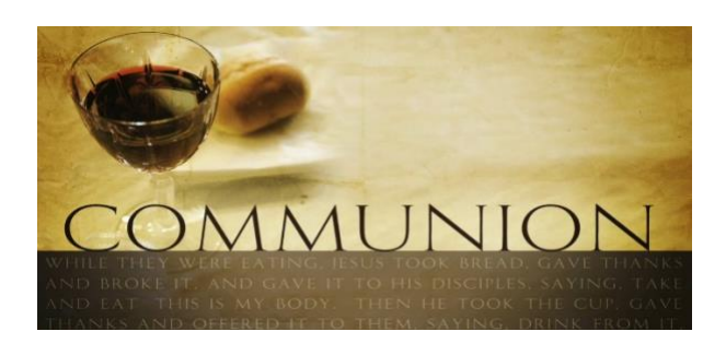
Celebration of Worldwide Communion Sunday, October 3<sup>rd</sup>